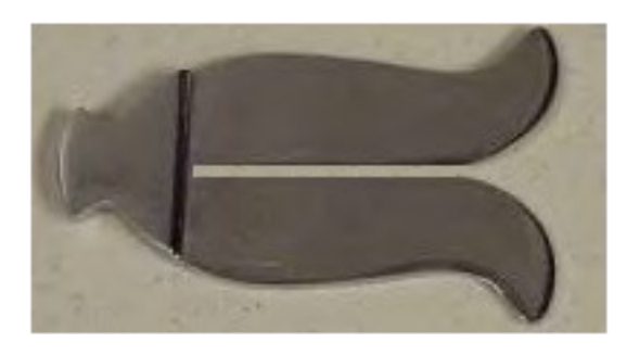
and Iz'mil (surgical blade)